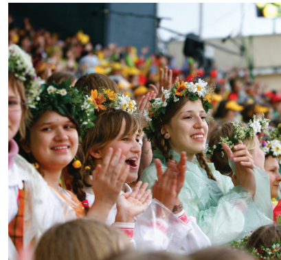
Research-related travels included visits to the National Song Festival in Latvia (2013), Estonian and Lithuanian song festivals (2014), and World Choir Games in Latvia (2014).