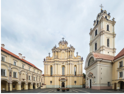
The 2014 trip included a lecture to students at Vilnius University, interviews published in the university newspaper and the periodical Bernardinai , and a translated excerpt from The Power of Song in the magazine Liaudies Kultūra .

The endowment proceeds have also paid for my travel to American and European conferences where I could present papers, compare my findings with other scholars and learn about the newest developments in the study of Baltic history, politics, literature and culture.